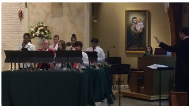
St. Patrick's Church (Rockville, MD) lead music for Christmas liturgies and their service of Lessons and Carols, December 2016.